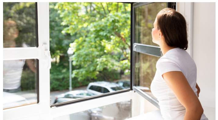
Air out the house when air quality improves.