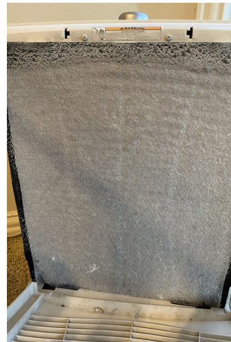
Air filter with cockatoo dander. If your HVAC system allows, consider upgrading to a MERV 13 or higher rated filter to trap more fine particles.