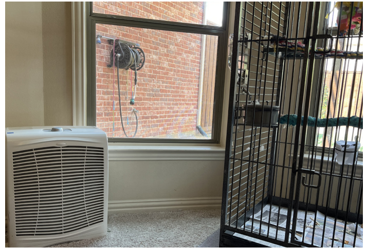
Employ portable air cleaners or high-efficiency filters to remove fine particles from the air.

Visit aav.org or find us on Facebook at facebook.com/aavonline