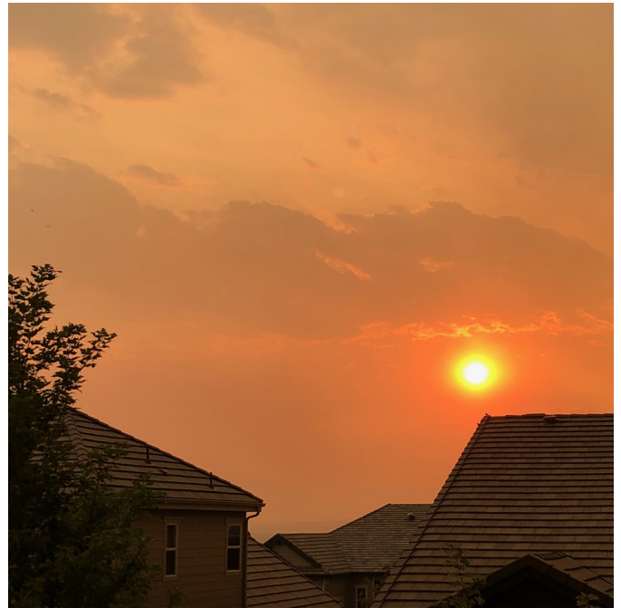
Forest fire smoke polluting the air over homes.