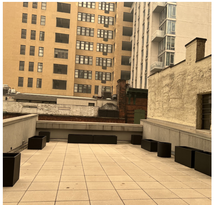
Poor air quality in downtown area on a wildfire smoke day.